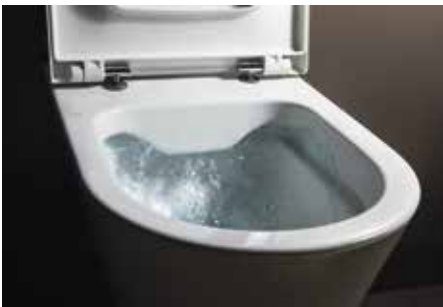
Water to operate the ceramic sanitaryware (B7)