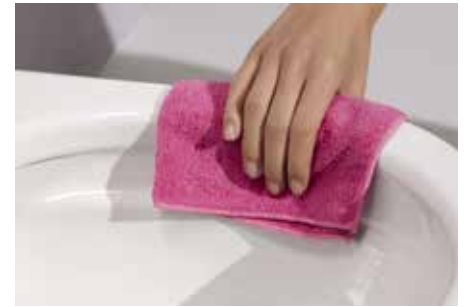
Cleaning to maintain the aesthetic quality of ceramics (B2)