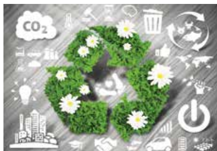
Potential benefits and loads beyond the product system boundary (D)