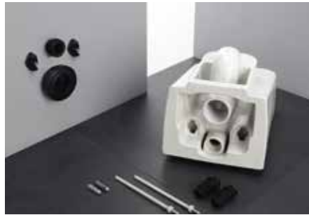
Installation in the building (A5)