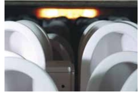
Production of Ceramic Sanitaryware (A3) Slurry, Casting, Drying, Glazing, Firing, Sorting, Packaging