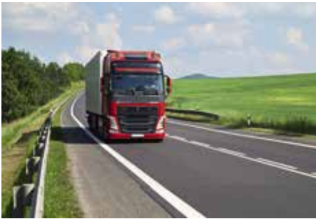
Transport to construction site (A4)