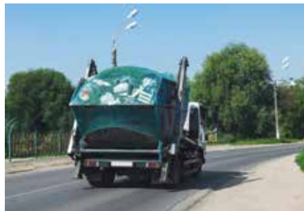
transport of ceramic sanitaryware to waste processing (C2)