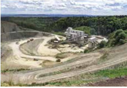
Raw material production (A1) Clay, Chamotte, Kaolin, Quartz, Feldspar, Zirconia

The images shown below depicts an overview of the system boundaries in this study: